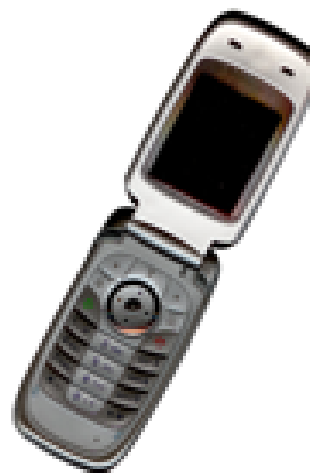
Fig. 2 Example of an unacceptable low-resolution image

must be placed after their associated figures, as shown in Fig. 1.