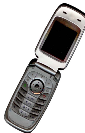
Fig. 3 Example of an image with acceptable resolution